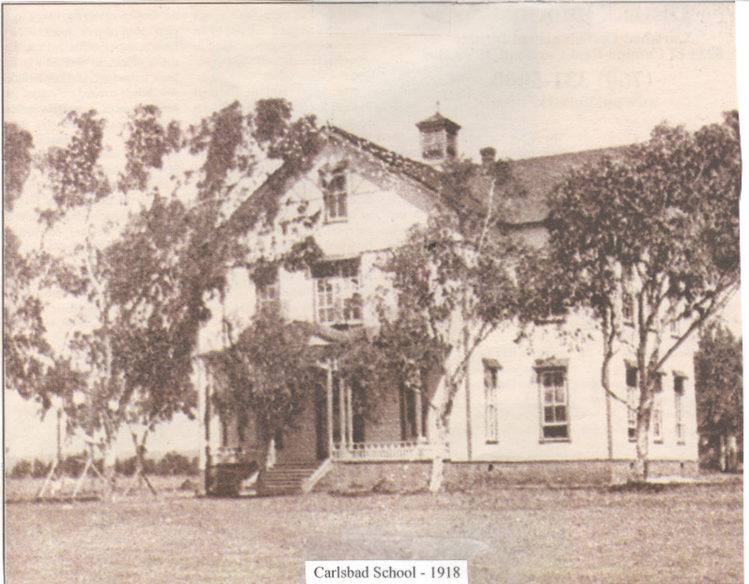
Carlsbad School - 1918

1775 Dove Lane, Carlsbad, CA 92009 (760) 602-2011