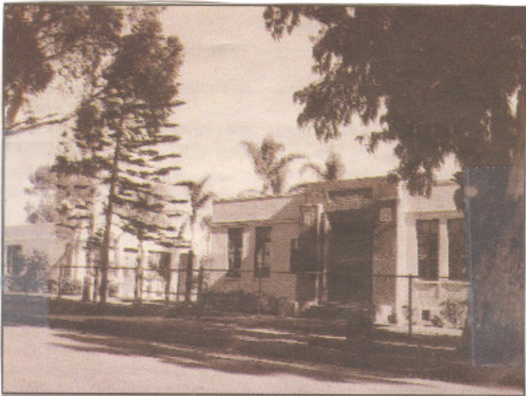
Pine School, 1954. This building was built in the 1920s to replace on the Carlsbad School.