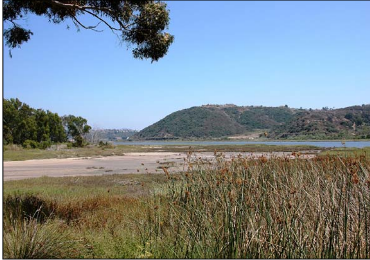
Batiquitos Lagoon from the north-side trails

On the southern edge of Carlsbad and about 3 miles from Kelly Ranch sits the Batiquitos Lagoon, one of the many beautiful natural wonders of Carlsbad. The lagoon consists of 610 acres with a drainage basin of about 55,000 acres. It is believed that the name 'Batiquitos' came from the regional Mexican Native American word batiqui meaning a shallow trough formed in dirt used as a watering hole or for the collection of fresh water.