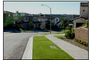
Speed is increasing in Calavera Hills – what you can do to slow it down