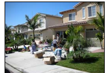
The Calavera Hills Spring Community Garage Sale!