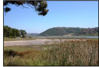
Learn about a beautiful Carlsbad open area – Batiquitos Lagoon