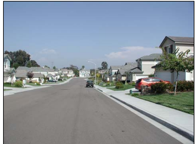
Foothill Avenue feeds several adjoining streets and with a slight grade, it's easy to go too fast