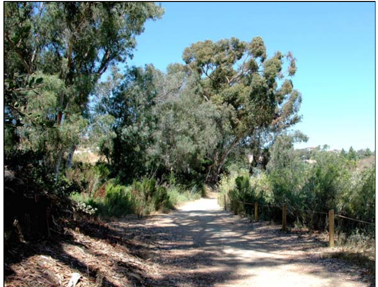
The trails at Batiquitos Lagoon

Batiquitos Lagoon is an ecological reserve owned by the State of California and managed by the California Department of Fish and Game. It contains a natural fish nursery and is a protected haven for other wildlife, so there is no swimming or boating, although there is fishing in designated areas. Over 185 species of birds have been seen at the lagoon, along with abundant fish and indigenous plants (although the vegetation has been seriously affected by years of commerce and the introduction of non-indigenous plants).