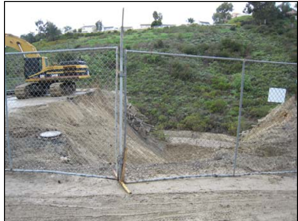
The driveway to the Calavera Hills RV Storage collapsed last month after heavy rains. This is actually a portion that is owned by the City of Carlsbad. They expect to complete repairs within the next 30 days.

A representative of the Prescott Company said the city was actively working on the project and that in the interim residents with vehicles or stored property were accessing the area via a utility access road a few hundred feet north of the main entrance. They also reported that the waiting list for storing a vehicle or other property in the facility is now approximately three years. The increase in wait-time is probably attributed to the increase in homeowners in the area. Calavera Hills has added over 1100 homes in the last 8 years, nearly doubling the demand for service like the RV storage area.