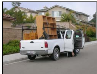
The Calavera Hills Spring Community Garage Sale – now benefiting local schools