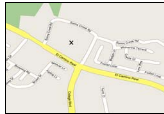
A new Wal-Mart in Carlsbad