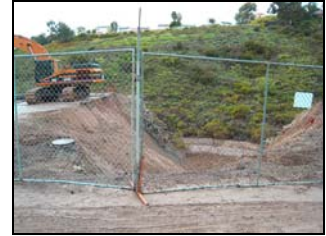
A Collapsed Driveway at the RV Storage Facility – And the Waiting List Grows!