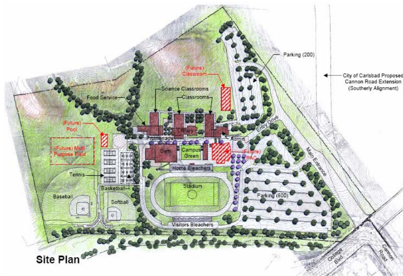
The current plan with the extension to Cannon Road re-routed.