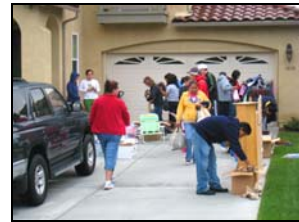
Fall Community Garage Sale - Just Around The Corner