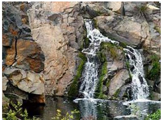
This is a recent photo of El Salto Falls facing north. Lots of debris has been pulled out of the falls area in recent years.