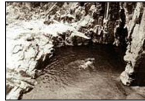
Oceanside Council Unanimous About El Salto Falls