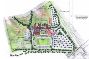
Plans for the New Carlsbad High School