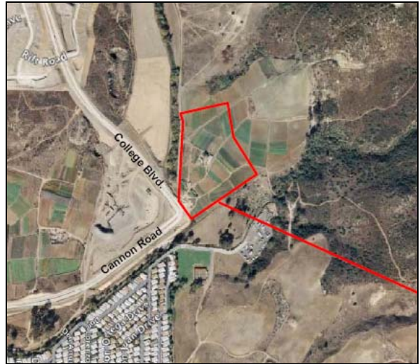
This aerial photo shows the positioning of the new high school at the corner of Cannon Road and College Blvd.

After reviewing the 60 pages of comments produced by multiple agencies regarding the project's June 2008 Environmental Impact Report (EIR), it was decided that there will be at least a one-year delay in the start of construction. Grading had previously been scheduled to commence in November 2008. Unfortunately, construction costs will be driven up by 3-4% because of the delay.